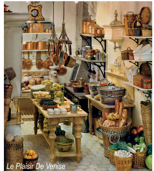
Le Plaisir De Venise

The European kitchen from Chessington Plaza by Dan McNeil is a favorite of mine. It doesn't feature as much food as the other examples, but its design with tiled sink and backsplash and copper