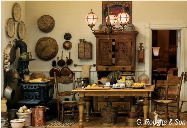
G. Roberts & Son

we share on Facebook are some of our all-time most liked posts.